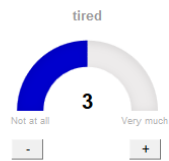
Figure 5: Rating an episode, part 2