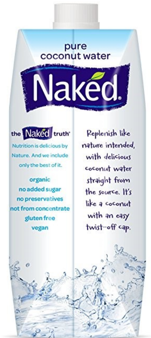
image2 (Section Products)

After you have finished reading this label, please click "Next".