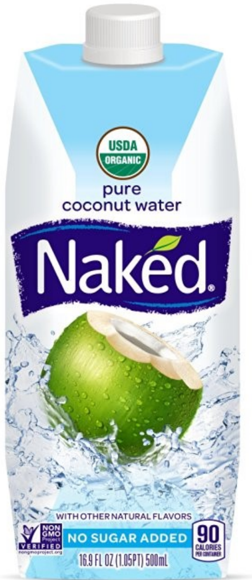
Figure 2: Label 2